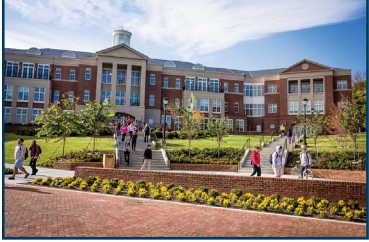
Radford University: The continued expansion of Radford University's campus supports the construction industry while providing quality education to its students.