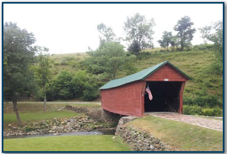
Quality of life is an important factor for rural and urban communities within the New River Valley.