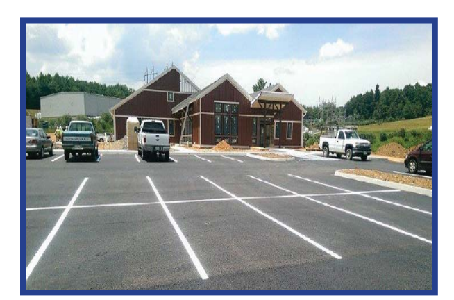
The Floyd Innovation Center will be completed in the fall of 2014 with the help of Economic Development Administration, Appalachian Regional Commission, and Tobacco Commission funding.