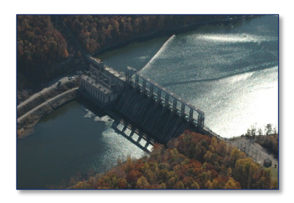
Claytor Lake Dam

The New River Trail stretches 57 miles along an abandoned railroad corridor.