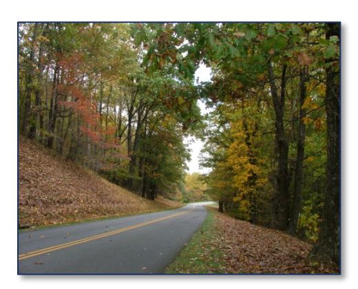
Blue Ridge Parkway