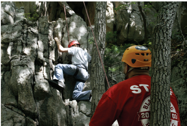
Rappelling the rock face.

Trails recognized under the National Trails System Act include the Appalachian National Scenic Trail. Other multistate trails include U.S. Bike Route 76 and the Great Eastern Trail.