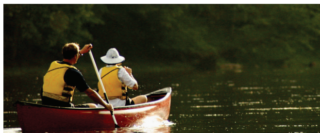
Paddling the New River.

Through the Virginia Outdoors Demand Survey and public meetings, citizens expressed interest in access to hiking and