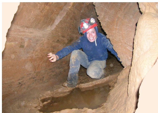
Spelunking in the New River Valley.