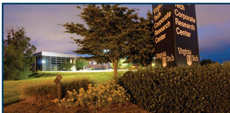
Virginia Tech Corporate Research Center: Virginia Tech is a Top 30 Public Research University according to the National Science Foundation.