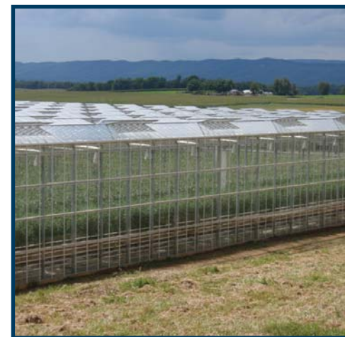
Red Sun Farms: year-round greenhouse facility located in the New River Valley Commerce Park

Source: Virginia Employment Commission, American Community Survey