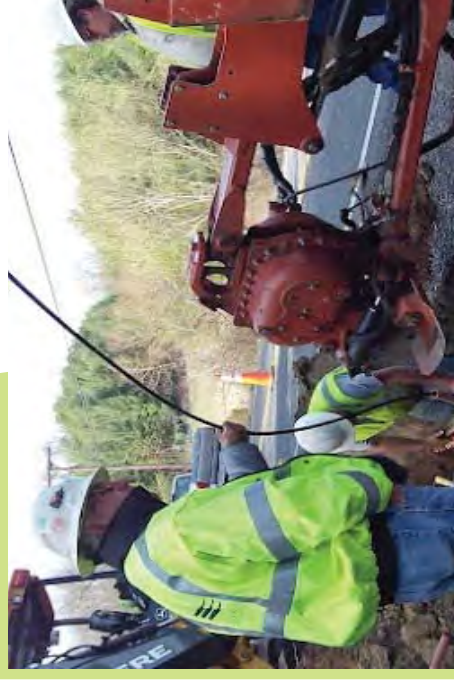
New River Valley Community Regional Broadband Network